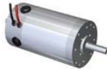
PM90 pictured with Parvalux standard flange